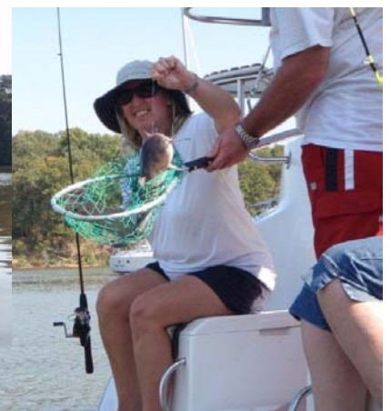
Fishing Competition was Intense