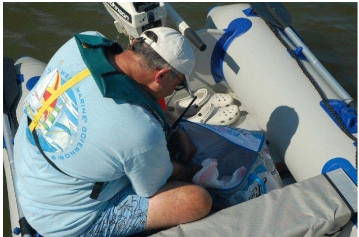
It would be easier if they would hold still!

In total, there were seven (7) fish caught and five (5) Crabs....all 'keepers'. With each fish or crab caught there were cheers congratulations and encouragement. Honorable mention needs to be made of the 'really big fish' that broke the line and got away....not sure whose fishing line was broken, but rumors persist.