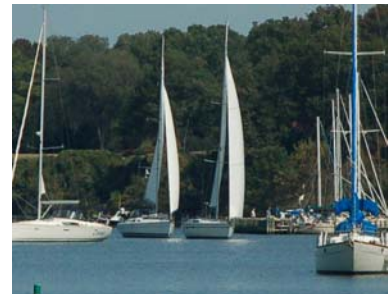
Objects are closer than they appear

Champagne approached the Worton Creek R2 Channel Buoy, only to head back out to sea to enjoy sailing in the increasing wind and risk winning the 'Calamity Cup' by 'sailing large and on the edge' through the Worton Creek Channel within 'spitting distance' of Narsilion . Champagne and Narsilion sailed up to Silent Running within minutes of the Fishing Tournament Start.